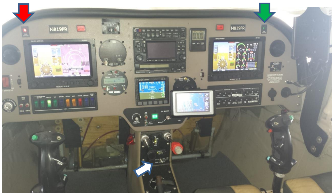
Trim Selector Switch to CoPilot – CoPilot LED is GREEN, Pilot LED is RED

I hope this helps anybody that is faced with the same trim control situation.