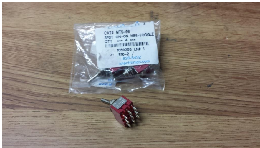
Triple Pole Double Throw (3PDT) ON-ON Switch

The 3PDT mini toggle switch was easy to find and they cost less than $2.00 each.