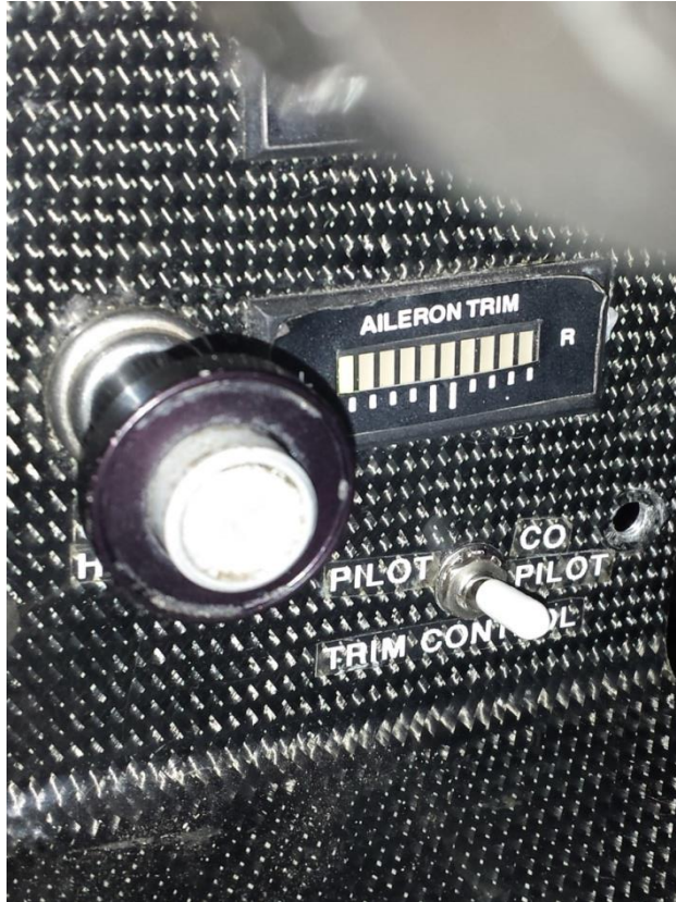
Trim Selector Switch

Back in 2012 when I designed my all glass instrument panel, I thought I had covered every possible situation you could encounter while flying. I was quickly proven wrong when I did my first flight with my wife. As we flew along she rested her hand on the co-pilot joystick, and since both joysticks have trim control, she accidentally changed the way the airplane was trimmed. Since I fly actual IMC, this was not part of an acceptable design to me. So I re-wired the trim circuit and installed a trim selector switch.