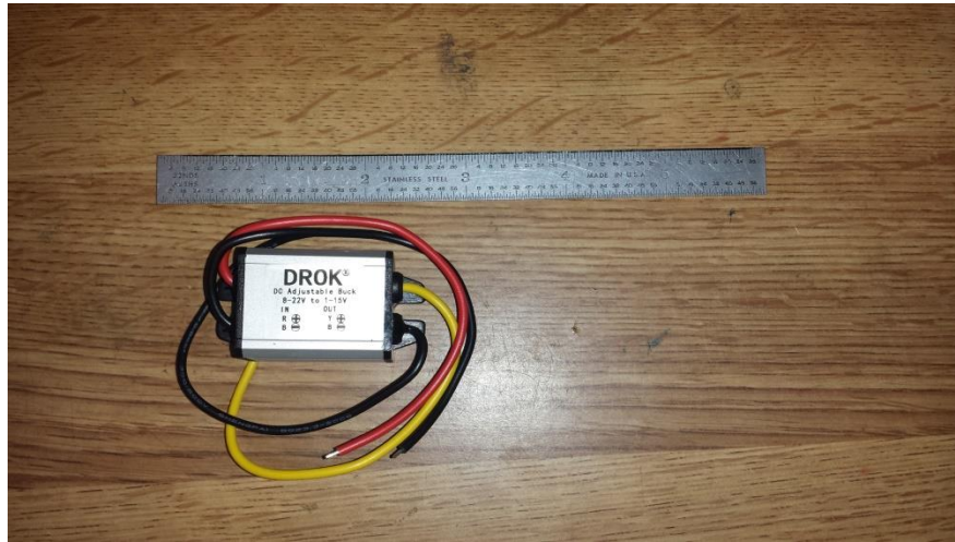
DC – DC Converter

The 3PDT mini toggle switch was easy to find and they cost less than $2.00 each.