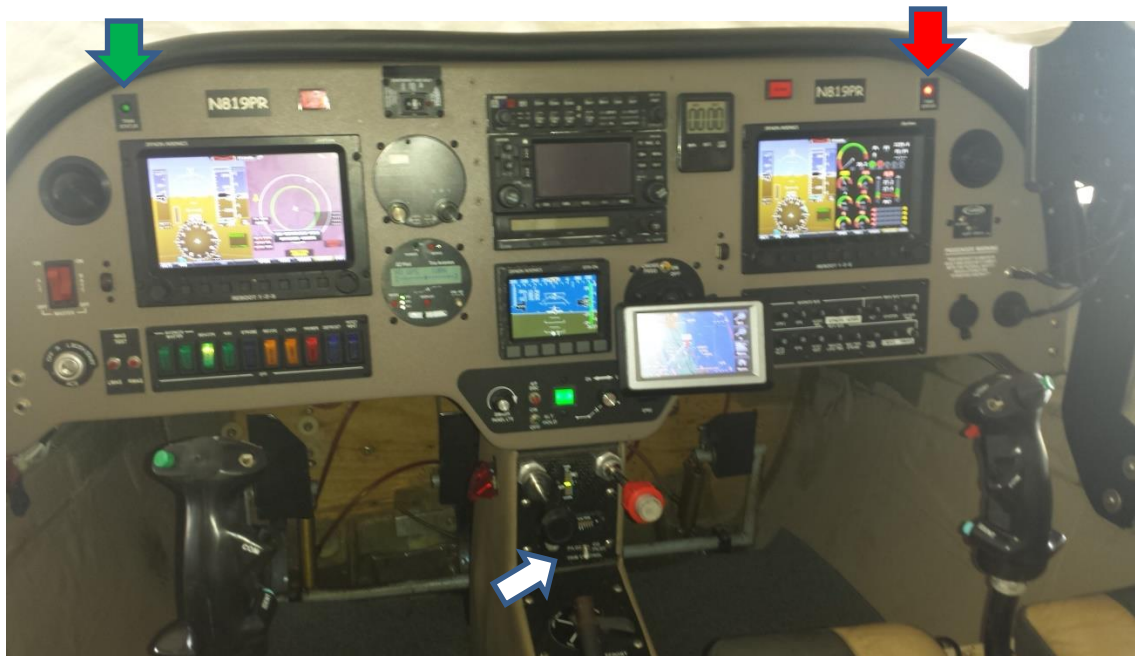
Trim Selector Switch to Pilot - Pilot LED is GREEN, CoPilot LED is RED