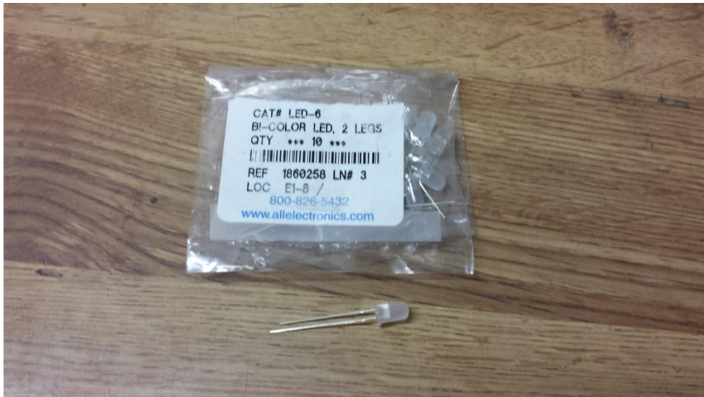
Bi-Color (RED/GREEN) LED

This LED glows RED or GREEN depending on the voltage polarity it gets. I figured if I used a triple pole double throw switch (3PDT, ON-ON) for selecting who has trim control and wired it correctly. When the pilot had trim control selected the LED, on the pilot side would glow GREEN while the LED on the co-pilot side would glow RED. When the co-pilot had trim control selected, the LED on the co-pilot side would glow GREEN while the LED on the pilot side would glow RED. This would be a very acceptable solution.